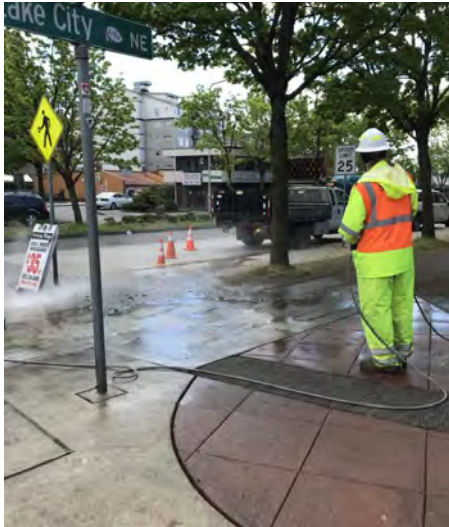
Pressure Wash- During